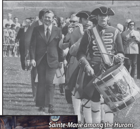
Sainte-Marie among the Hurons

SAINTE-MARIE AMONG THE HURONS: Sainte-Marie's history dates back to the 17th century. More than 25 buildings have been recreated on their original locations providing visitors with a sense of Indigenous