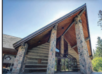
McMichael Gallery in Kleinburg is temporarily closed but its nature trails are open.