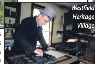
Westfield Heritage Village